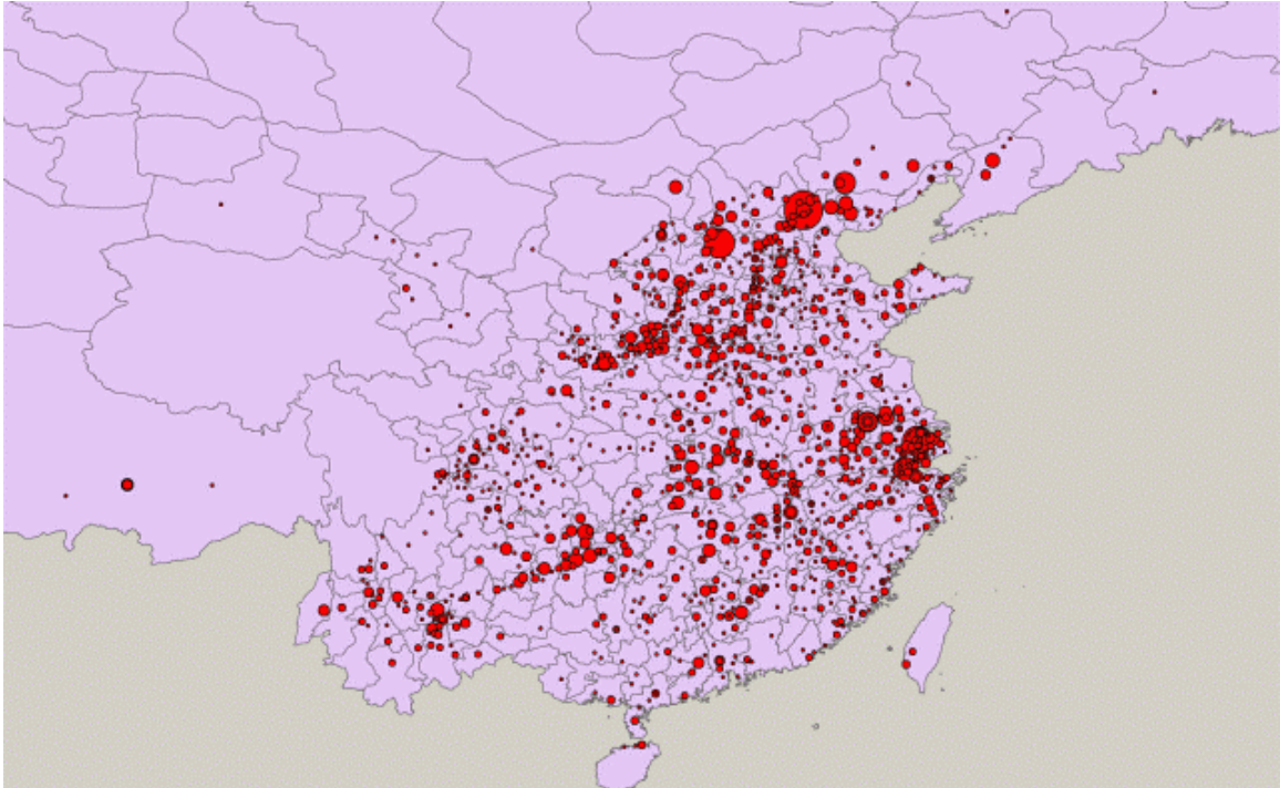
Figure 4: map with point symbol sizes proportional to number of temples at each location

What this does, essentially, is to count the number of unique occurrences of values in the parent_id field and save them into a new delimited text file. The resulting text file was then joined to the GIS layer using the Point ID # of the temple records as the key ID. The result is that for each temple record in the GIS layer we now have the field COUNT. The values in the COUNT field are then used to display the number of temples at each location, using larger point symbols for higher COUNT values.